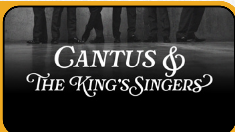
CANTUS & THE KING'S SINGERS* THURSDAY, FEBRUARY 12, 2026