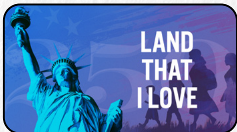
LAND THAT I LOVE OCTOBER 18 - 26, 2025

Single tickets on sale Tuesday, September 2, 2025