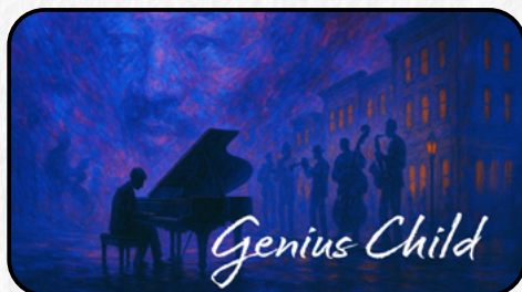
GENIUS CHILD JULY 14 - 17, 2026