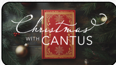
CHRISTMAS WITH CANTUS DECEMBER 12 - 22, 2025