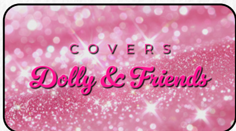
COVERS: DOLLY & FRIENDS MAY 30 - JUNE 7, 2026